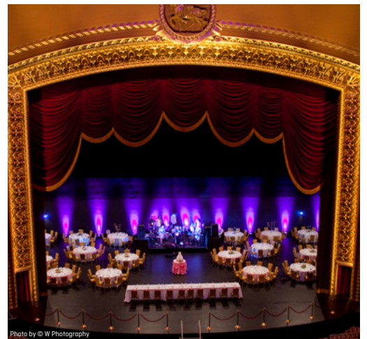
Grand Theatre Reception: 300 Max Seated Capacity